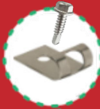
Wire guide brackets w/screws