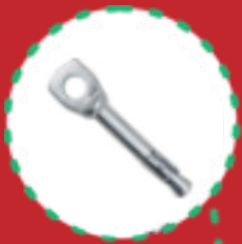
Tie wire wedge anchors